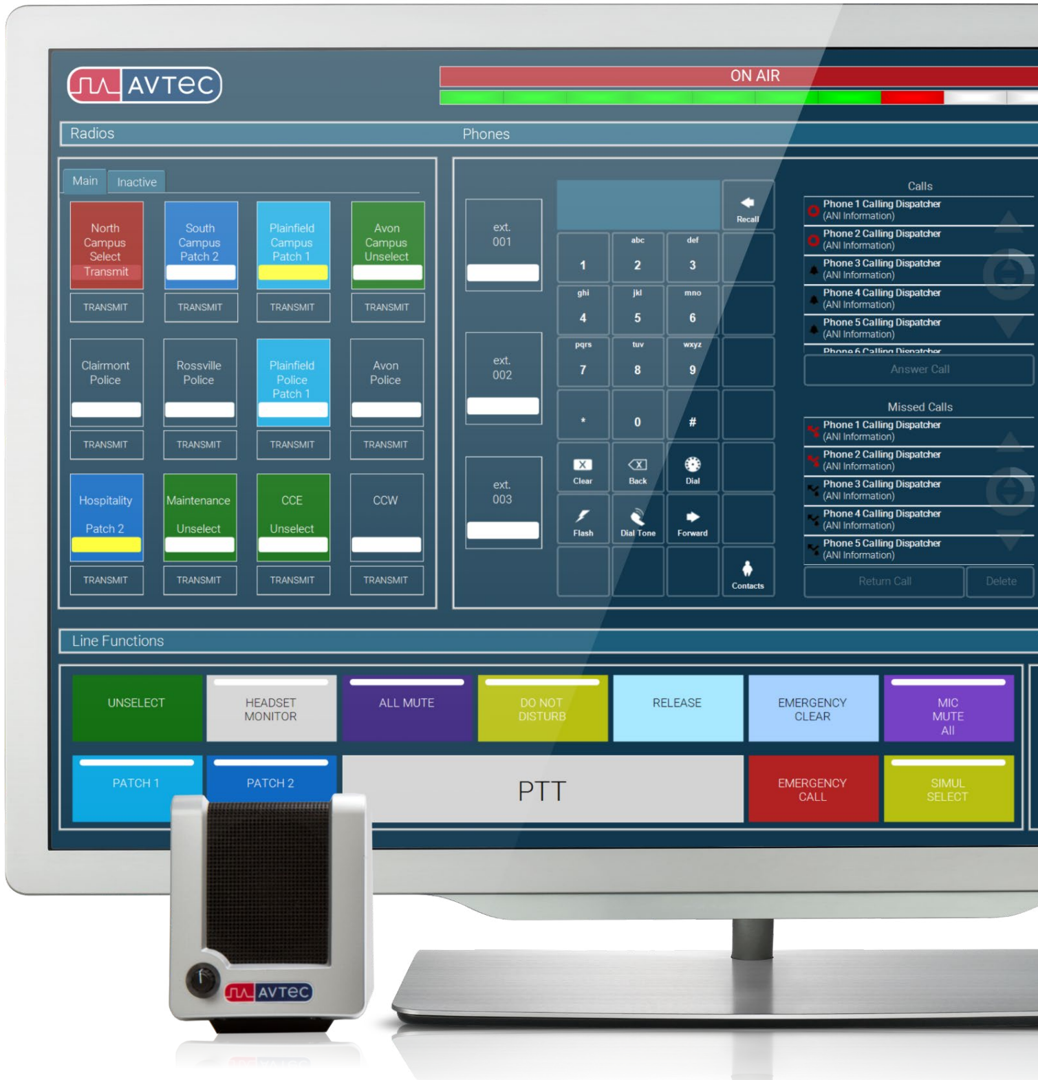
Avtec Scout Dispatch Console